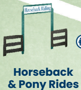
Horseback & Pony Rides