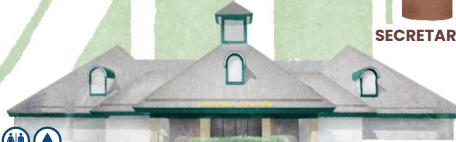
Visitor Center - Gift Shop