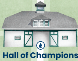
Hall of Champions

Rolex Stadium and Equine Competitions >>>