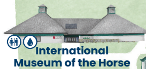
International Museum of the Horse