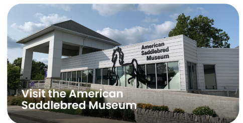
Visit the American Saddlebred Museum