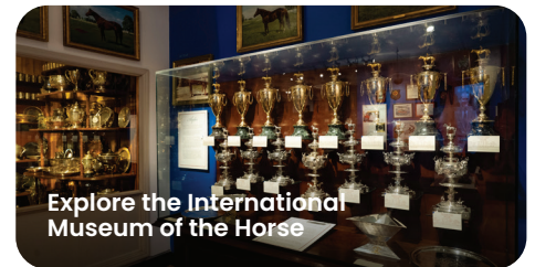
Explore the International Museum of the Horse