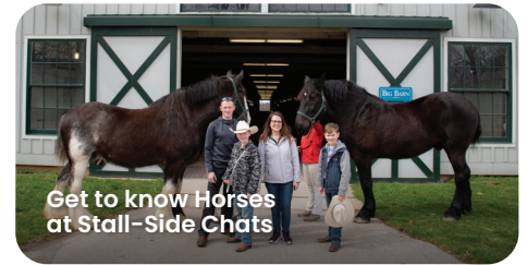
Get to know Horses at Stall-Side Chats

Purchase your tickets at the KHP Campground Store for discounted pricing.