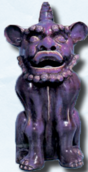
Chinese Porcelain k'i-lin, taken from a mold of the K'ang Hsi period (1662-1773) and made during the late Ch'ing Dynasty (1644-1911).