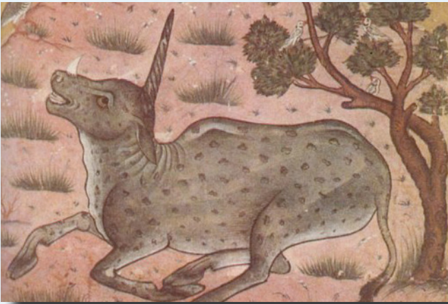
A seventeenth-century adaptation of a Persian manuscript dated 1460. The Karkadann waits patiently for the ring dove to alight on its horn.

The myth of the unicorn portrays the creature as horse like with one long horn protruding from its forehead. Many different cultures have variations of unicorn creatures. In China, a myth tells us of an animal that looks like a dragon but has one horn called the qilin. The myths tells that the qilin sprung from the center of the earth. In Persia, they told stories of the Karkadann. The Karkadann has a horn like a unicorn but has a bad temper. Some believe that the Indian Rhinoceroses that live in the region are the origin of this legend.