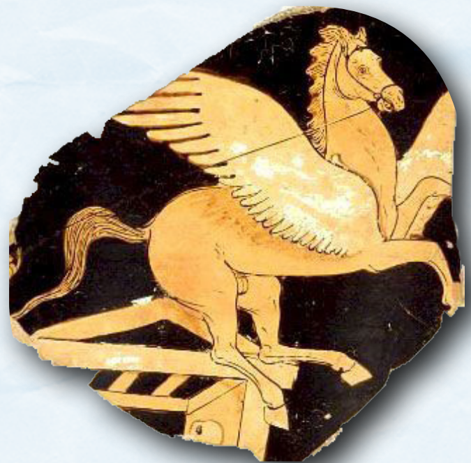
Pegasus at the spring, Apulian red-figure vase C 4th B.C., Tampa Museum of Art

The legend of Pegasus originates from Greece. Pegasus is the son of Medousa, the demon that had snakes for hair and turned anyone who looked at her to stone. Pegasus' father is Poseidon, the god of the ocean. Pegasus looks like a regular horse but has two large wings coming out of his back to help him fly. Pegasus flies up to the top of Mount Olympus, where Greek gods live, and becomes Zeus' horse. Zeus gave Pegasus his own constellation to reward him.