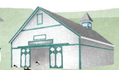
Mounted Police Barn