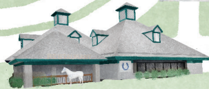
Iron Works Café Open 11am to 3pm