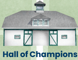
Hall of Champions

Rolex Stadium and Equine Competitions >>>