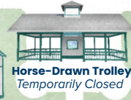
Horse-Drawn Trolley Temporarily Closed